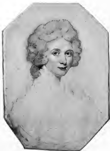
Unfinished miniature By Edward Miles